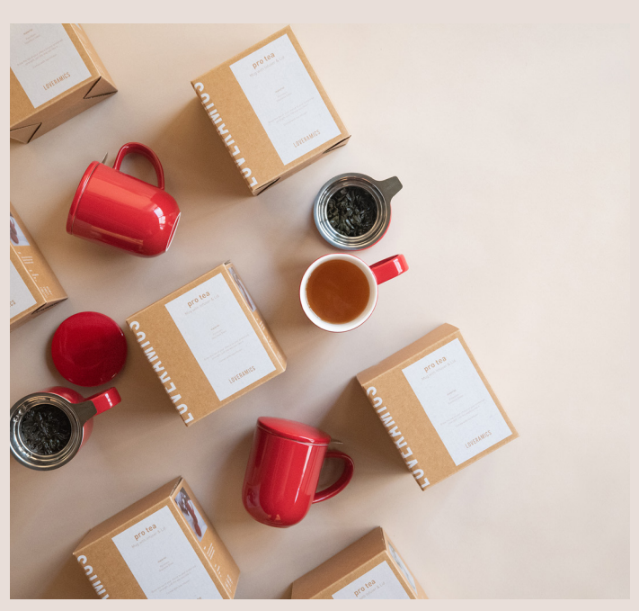
Handle Get a grip and pour with ease - our handle is designed for maximum comfort.